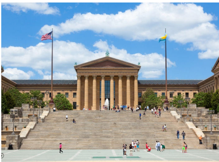
Philadelphia Museum of Art and the Rocky Steps

Nearby attractions include Adamstown, known as America's best antiques town. According to one of our NSCC members, Adamstown has more Shelley than she has ever seen in one place. Conference organizers are hoping to arrange a day trip to Adamstown, perhaps on Thursday before the conference begins.