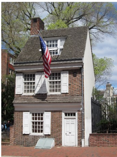
Betsy Ross House